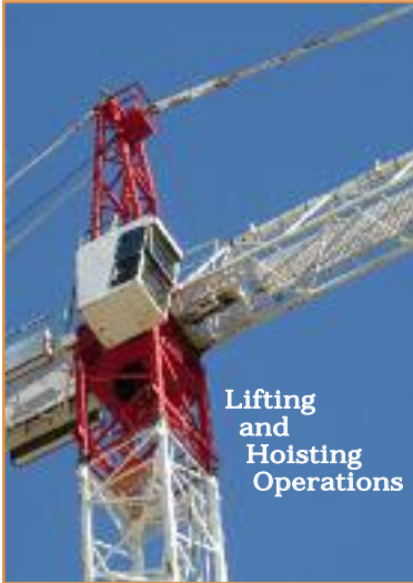
Lifting and Hoisting Operations