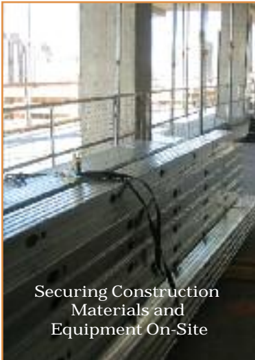
Securing Construction Materials and Equipment On-Site